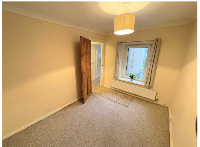
Bedroom two 8'0" x 10'7" (2.450 x 3.231)

Double bedroom with coved ceiling, radiator and window to rear.